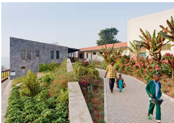
Butaro Hospital, Rwanda, MASS Design Group