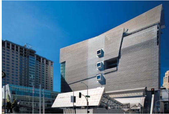
San Francisco Federal Building, USA, MORPHOSIS