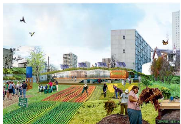
R-URBAN, France, atelier d'architecture autogérée (AAA)