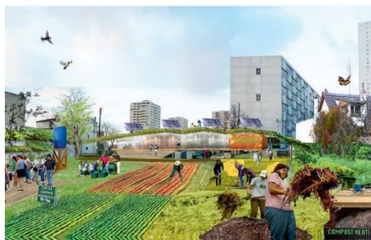
R-URBAN, France, Atelier d'architecture autogérée AAA Category: Research & Initiative