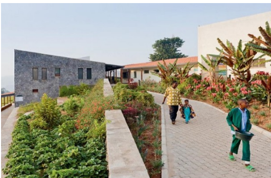
Butaro Hospital, Rwanda, MASS Design Group NYC Category: Built environment