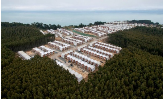
“Pres Constitution”, CHILE, Studio ELEMENTAL Category: Urban Developments & Initiatives