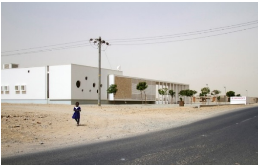
“Port Sudan Pediatric Centre”, Studio Tamassociati Category: Buildings