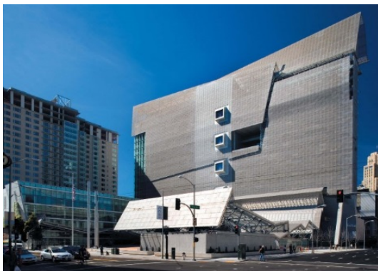
San Francisco Federal Building, USA, MORPHOSIS Category: Built environment