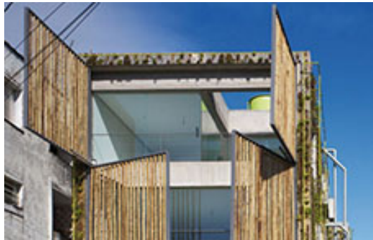
Harmonia 57, Brazil, Triptyque Category: Built environment